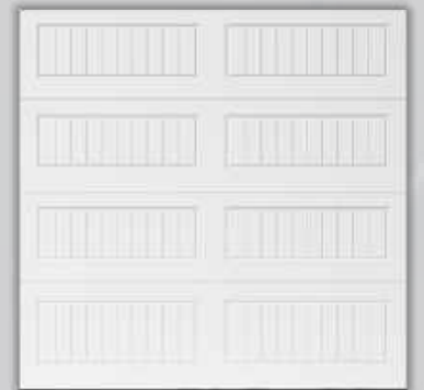
LONG STAMPED PANEL