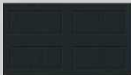
Matte Navy Blue