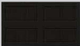
Matte Dark Brown